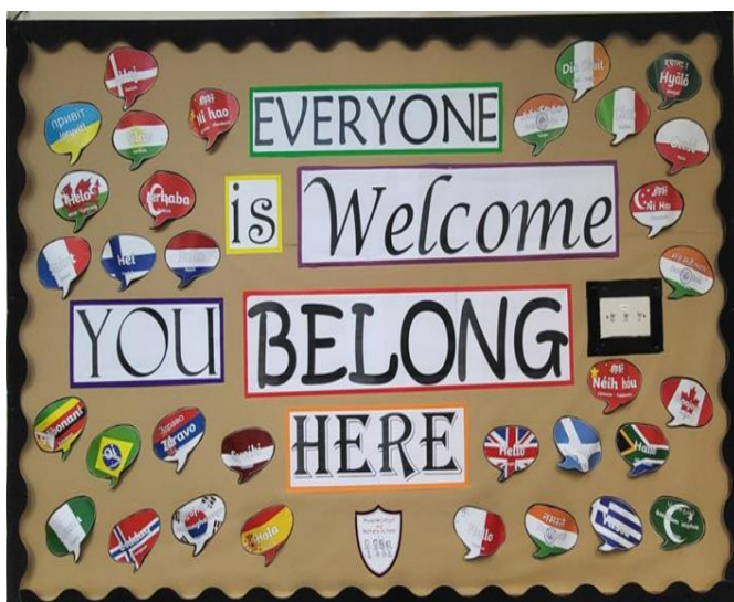
Language of the Month display in the main entrance

Language of the month | Phoenix Infant and Nursery School (secure-primariesite.net)